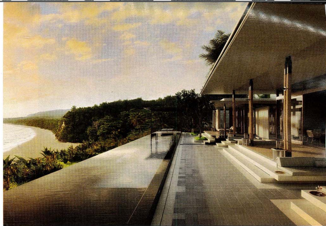
Above: an Amanera Founder Villa at the Playa Grande Club & Reserve, Dominican Republic, villas from £4m. Below: One River Point in Miami, residences from $750,000

Across the Atlantic, Aman Resorts , famed for its ne plus ultra holiday offering, has chosen to launch its first golfing project in the DOMINICAN REPUBLIC , a Caribbean island now something of a mecca for those targeting a hole in one. A natural rainforest preserve framed by mountainous jungle and poised on 60ft cliffs, The Playa Grande Club & Reserve ( www.playagrande.com ; from $4m) has a Robert Trent Jones Sr-designed course, a mile-long stretch of untouched sand and, of course, all the luxury facilities