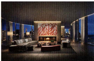
Above: the living room of the penthouse at 160 Leroy in Manhattan's West Village, $80m