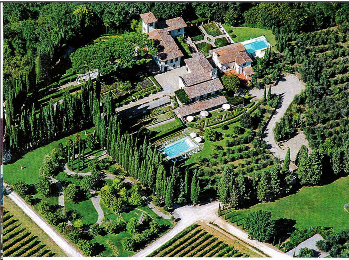
Above: Tuscan Chianti Estate in Tuscany, €17.15m. Below: the living room of a three-bedroom property at Les Résidences du Plein Air, Loire Valley, prices start at €2.3m

question has been envisioned by one of the world's leading architects. Rathbone Square ( www.rathbonesquare.co.uk ; penthouses from £4.475m), just north of Oxford Street in Fitzrovia, has been designed by Make Architects, whose founder, Ken Shuttleworth, is the defining hand behind such iconic landmarks as the Wembley Stadium arch, The Gherkin and the Millennium Bridge. One of the first to be created in the city centre for more than 100 years, the square will, on its completion in 2018, be a real live-work space, open to the public during the day, but allowing owners of the 142 sleek apartments to have it to themselves at night – along with the private pool, screening room, wine cellar and lounge.