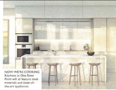
NOW WE'RE COOKING Kitchens at One River Point will all feature sleek materials and state-of-the-art appliances.

SEEING IS BELIEVING! To view Privé from every angle, prospective residents can request boat and helicopter tours of the property and its surrounding island