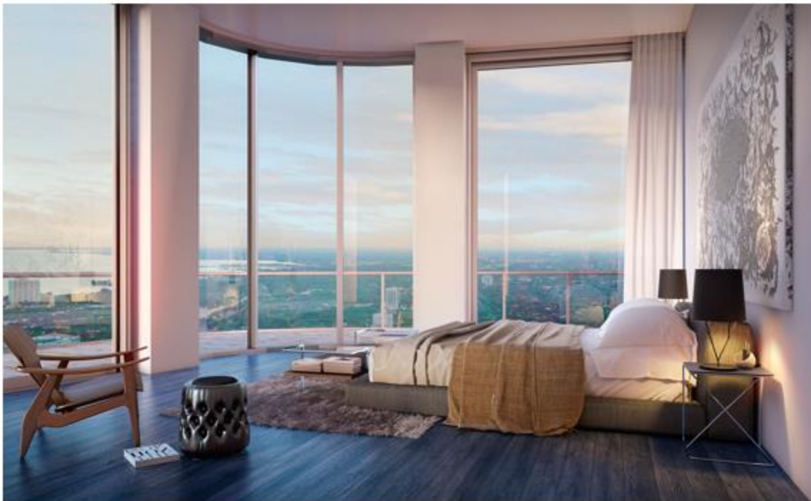
A bedroom at Arquitectonica's 450-unit SLS Lux with interiors by Yabu Pushelberg and views across Biscayne Bay