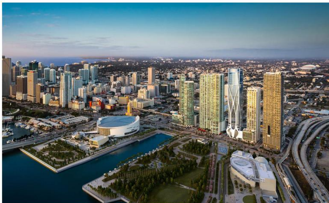
One Thousand Museum

Herewith, our pick of the choice residential addresses to consider moving into.