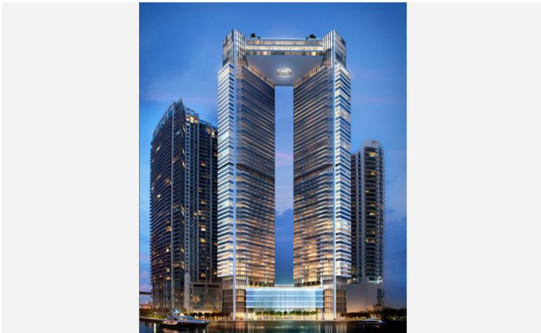
One River Point

Architect Rene Gonzalez's titular louvres provide welcome shade, but also subtly demarcate public spaces while casting eye-catching patterns on the stonework of this three-storey, 12-residence property in Miami Beach's South of Fifth Street neighbourhood of Miami Beach. Launched September 2017.